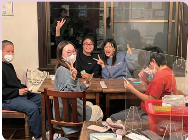
Y-koko Kitchen at Kyoto YWCA