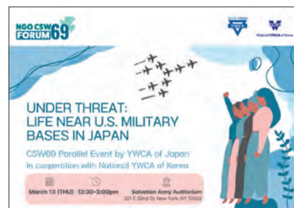
A copy of the event flyer

The delegates independently organized an event under the title “Under Threat: Life Near U.S. Military Bases in Japan.” An online session was held in Japanese language, followed by the main event conducted in English on-site in New York.