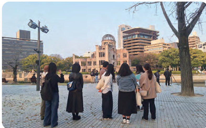
In front of the A-Bomb Dome

The "Pilgrimage to Hiroshima" is a three-day, two-night program held in Hiroshima, where participants—mainly youths from across Japan, along with guests from the YWCAs of China and Korea—listen to atomic bomb survivor testimonies, visit the Hiroshima Peace Memorial Museum, tour various cenotaphs and monuments, to reflect on peace. First launched in 1970, the program has continued every summer as a way to embody YWCA's core identity of "Assuming an Anti-Nuclear Stance".