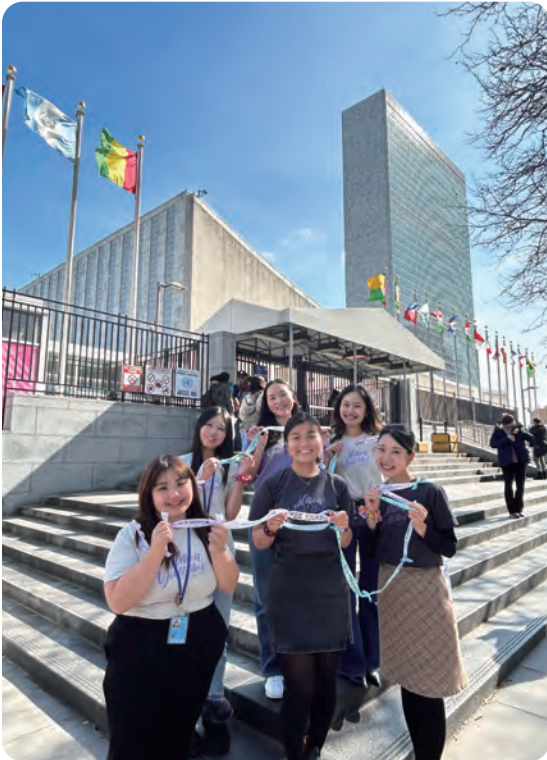
In front of the United Nations Building