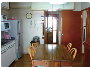
Second House in Kobe

Later, on September 7th, Sendai YWCA held a film screening and discussion of the narrated picture-story play “We’re Sorry — We’ve Been Lying All Along: From Fukushima Daiichi and All the Other Nuclear Power Plants,” in which the nuclear plants themselves serve as the main characters.