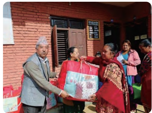
Nepal YWCA members delivering supplies to disaster survivors

“Even though this is the challenging task during the pandemic, small token of love provided their need in time. It helped them for their self-dignity and hope for the future; we were able to reach to the unreached community. We received the resources from donors is great support in right time, the helping hand from the local peoples. We tried our best to fund raise locally ourselves. Some of the board members, staff also contributed. It was an encouragement to work more.”