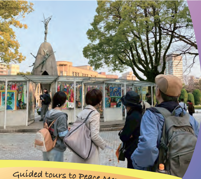
Guided tours to Peace Memorial Park and vicinity