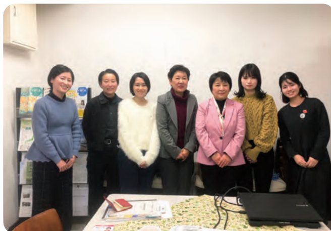
With the speaker for “Bringing Women’s Voices into Politics”

This year, the Youth and Gender Subcommittee focused on the theme “Politics and Gender,” engaging in activities to raise awareness about gender issues in the political and social spheres. From October 14th to 27th, in conjunction with the general election for the House of Representatives, members used social media to share the key points they were paying attention to in the election, what they expected from the candidates, and their thoughts on local issues and possible solutions. On January 12, we invited Tokyo