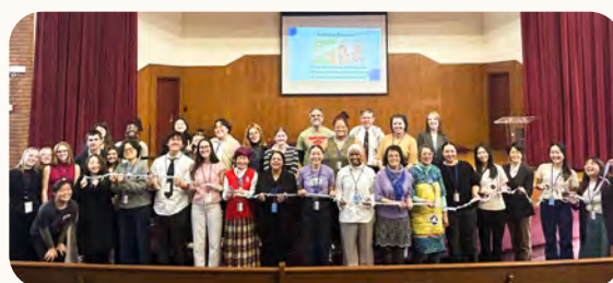
Participants to the event hosted by YWCA of Japan during CSW69 (New York)