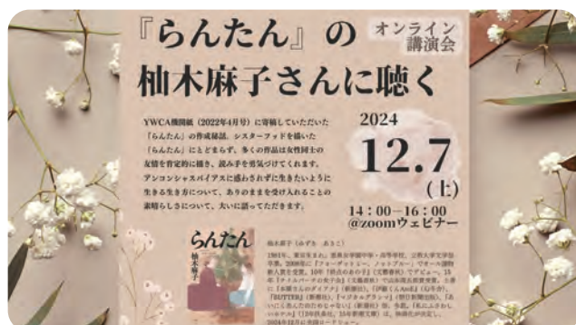
Flyer of the event

7th December 2024 @Online / Number of Participants: 95