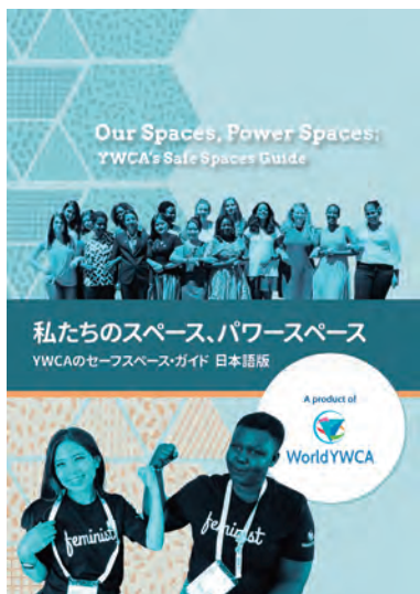
Cover of the Japanese translation