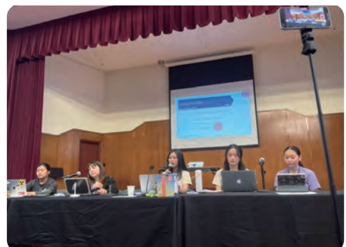
The delegates during their event

At the conclusion of the event, a powerful message of solidarity was delivered by a member of a Pacific-region YWCA.