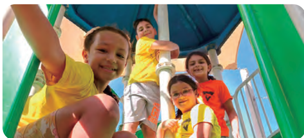
YWCA of Palestine kindergarten

The YWCA of Japan also supports the “Olive Tree Campaign”, which delivers olive trees to the Palestinian land which is threatened by the Israeli army and settlers. For every 4,000 JPY donated, one olive tree sapling is delivered to Palestine. Donations collected through YWCA of Japan has amounted to 209 trees in 2024.