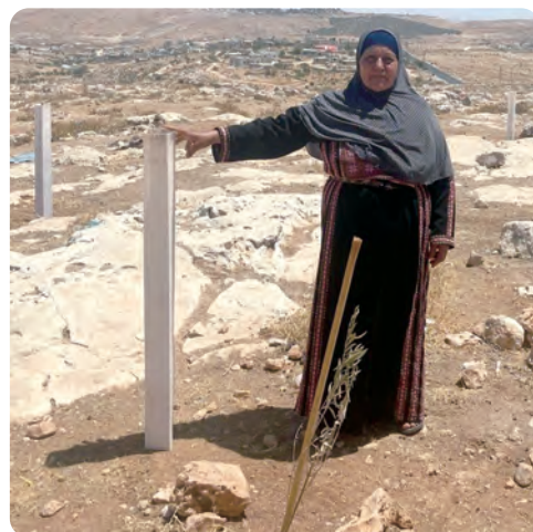
A female farmer from Hebron district. Amid the threat from the settlement built nearby her farm, she was able to plant 200 olive trees that was donated from the campaign