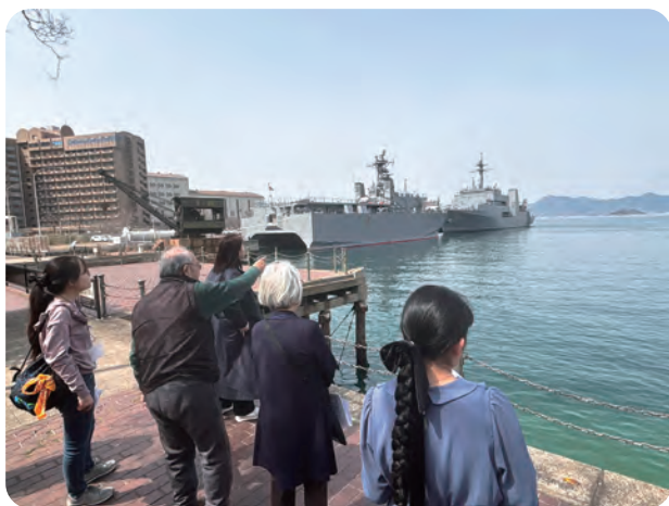
At the "Past and Future of Kure City" fieldwork

During the fieldwork, participants were divided into three groups and explored different routes: "Following in the Footsteps of Those Who Cared for Hiroshima from Abroad," "History of Korean Hibakusha in Japan," and "The Past and Future of Kure City." They listened carefully to the stories told by Hibakusha, air raid survivors, and those who carry on their testimonies.