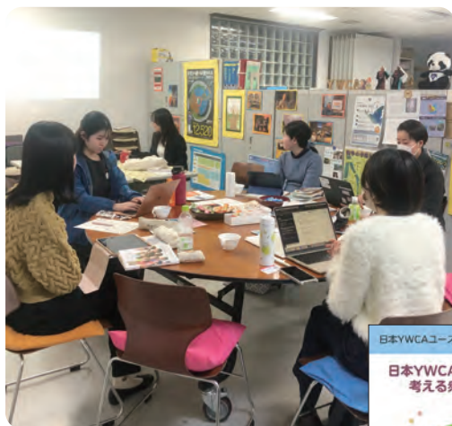
The online workshop