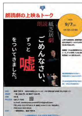
Event flyer from Sendai YWCA