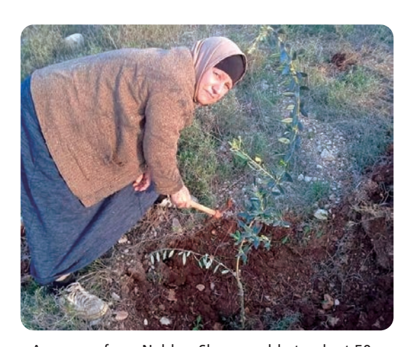
A woman from Nablus. She was able to plant 50 olive trees in her farm which was formerly destroyed by settlers.

For every 3,000 yen donated, one olive tree sapling is delivered to Palestine. Donations collected through YWCA of Japan in 2023 has amounted to 309 olive trees in 2023.