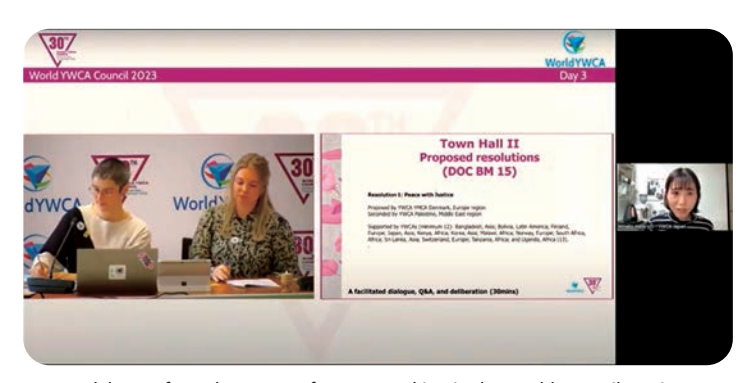
A delegate from the YWCA of Japan speaking in the World Council session

After 126 years since the first World Council in 1898, the World YWCA Council 2023 was held online for the first time. The Council consisted of more than 540 participants,