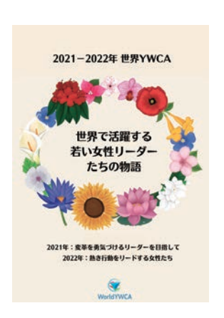
Inspiring Leaders Aspiring Action