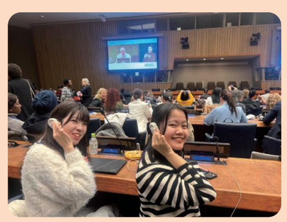
Attending the CSW opening plenary session in the United Nations building

I had the rare opportunity to attend an event hosted by the YWCA of Palestine, and to gain a better understanding of the current situation in Palestine.