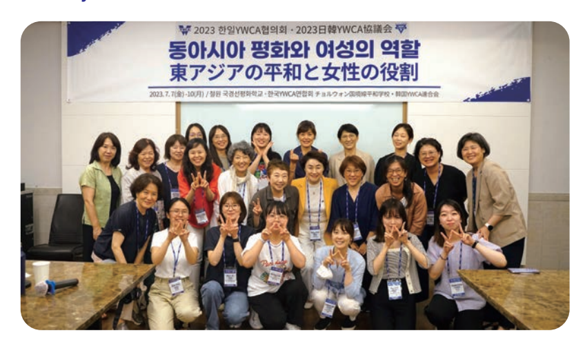
Posing with the sign "W" for Women

The "Korea-Japan YWCA Conference," a gathering of representatives from the YWCA of Japan and the National YWCA of Korea, was held under the same theme as the Korea-Japan Youth Conference held in the same year: "Women, Peace, and Security (WPS)". In addition to reports on the activities of each YWCA and exchange of opinions, participants visited Tieluan County, located in the DMZ (demilitarized zone near the 38th