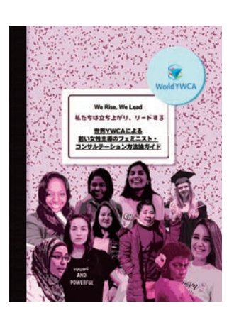
The World YWCA's Young Women-Led Feminist Consultation Methodology Guide

Japanese versions can be downloaded or purchased on the YWCA of Japan website.