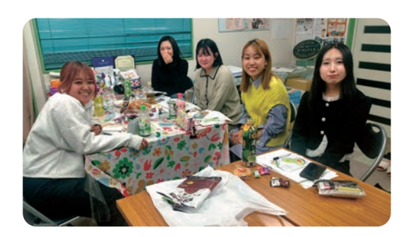
Activities at Caro Fukushima

The YWCA of Japan's support activities for the survivors of the Great East Japan Earthquake are planned and operated with the determination to continue supporting children born on the day of the disaster, until they become 20 years old. 2023 was another year of efforts to provide support for the future, while facing the challenges that arise every day.