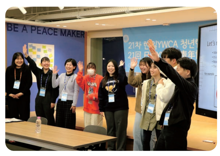
Participants of Korea-Japan Youth Conference

On the first day, the participants listened to a lecture on "Women, Peace and Security" and conflicts around feminism and gender issues in Japan and Korea. In the end of the day, they shared a time to socialize over crafting traditional Japanese game cards and dancing.