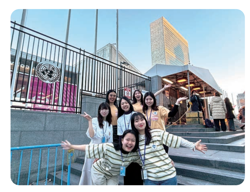
In front of the United Nations building

The participants hosted their own event, about the hardships young women in Japan face in their daily lives. The event was a great success, with an audience overflowing the seats in the 40-person capacity room. The life