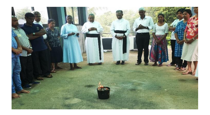
Healing the Memories" Program in Sri Lanka