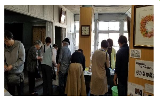
At the screening

Two movies, "A Bold Peace" and "Sonita," were shown in fiscal 2019 to provide opportunities to think about peace. There were 114 participants in total. The movies served as a preface for many people to know about the activities of the YWCAs and the number of Constitution Group members increased.