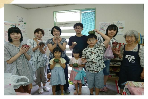
Parent-children workshop for summer holidays at Caro Fukushima

Total number of users in fiscal 2019: 537 people