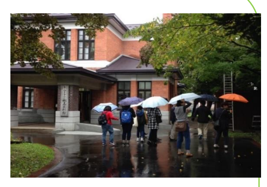
Fieldwork Activity of YWCA Protectors of Peace

In order to encourage junior and senior high school students and the youth to participate in the activities of "YWCA Protectors of Peace" that has created local peace maps, these YWCAs digitalized the Hakodate Peace Map, held 10 sessions of Constitution Café, and conducted a study meeting prior to the lecture of Mr. Arthur Binard planned in 2020. A total of 282 people participated in these activities.