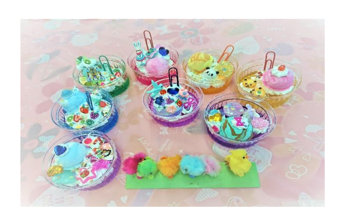
Participants' works from the workshop

Total number of users in fiscal 2019: 537 people