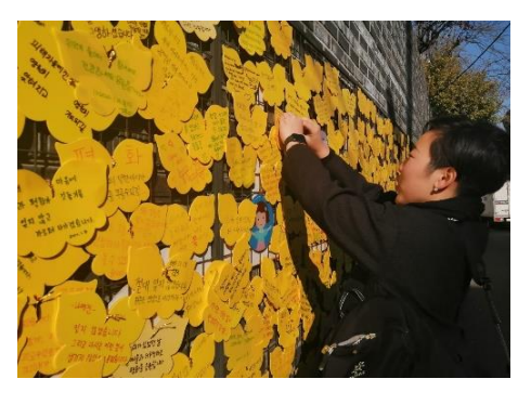
At the War and Women's Human Rights Museum

This event made me feel that we, as a generation that has never experienced the war, have the possibility to realize peace in an unprecedented way. Besides passing on the lessons of the tragedies of war and the reality of "Comfort Women" issue, I believe we can have dialogue in our own way about these deeply embedded issues.