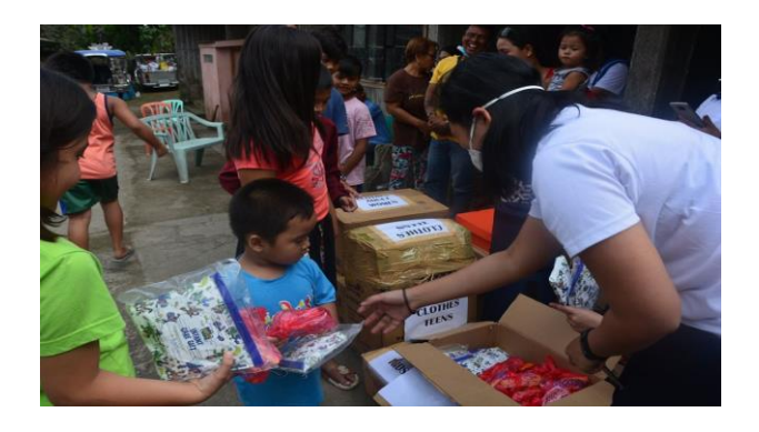
Relief activities for disaster survivors by YWCA of the Philippines