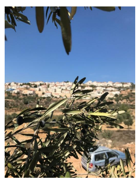
Israeli settlements seen from an olive

Due to the long military occupation by Israel, Palestinians' lives have been threatened. JAI (Joint Advocacy Initiative- a joint project conducted by the YWCA of Palestine and the East Jerusalem YMCA) is working on job creation, environment preservation, stabilization of livelihood, and dissemination of information about current situation in Palestine through nonviolent act of planting olive trees. Olive trees are deeply rooted in the lives of Palestinian people. People from all over the world can join the olive tree planting by donation. By donating 3000yen, you can plant one olive