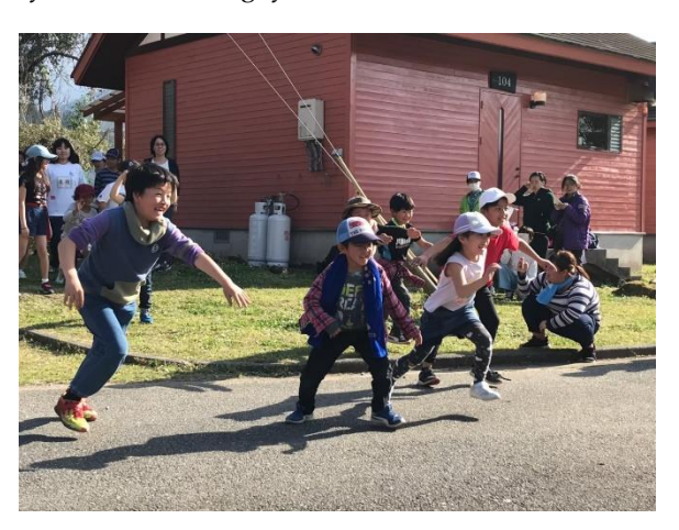
"Wakuwaku Camp" by Kumamoto YWCA