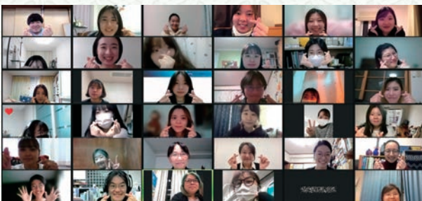
Participants gathered online

This 3-month program was planned and managed by committee members, mainly consisting of youth and young women. The diverse team of young people, including those who participated for the first time this year as well as those who have been participating for years and have made the Japan-Korea Youth Conference a larger and richer program, worked hard together to explore ways to improve the program within the limits of an online event.