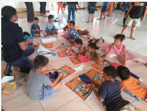
Tonga: Caring for children in an evacuation center

The YWCA of Japan, in cooperation with YWCAs overseas, conducts emergency relief activities by raising funds and supporting the activities of YWCAs in the affected areas in the event of a disaster. In 2021, in the aftermath of a volcano eruption in Tonga, we delivered support to a women's organization in Tonga through a coalition of NGOs, of which the YWCA of Papua New Guinea, the YWCA of Solomon Islands and the YWCA of Samoa are also members.