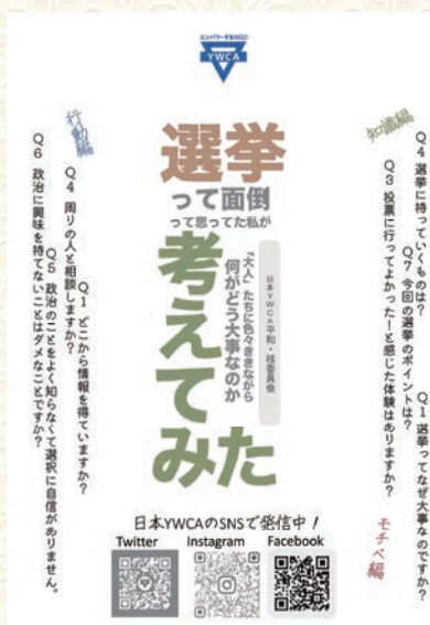
Special infographic for election

In 2021, a national election for the House of Representatives took place in Japan. In order to realize a society in which every individual is valued, there is a need for political change. The committee members of the YWCA of Japan in charge of peace and anti-nuclear action have discussed themes such as "what elections are", "what it means to vote", and "how to engage people, not limited to young people, to be interested in elections", and shared their ideas through social networking services and print media. The YWCA of Japan will continue to deliver effective outreach in the lead up to the coming national elections.