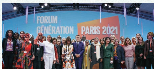
Left: GEF in Mexico (March 2021)