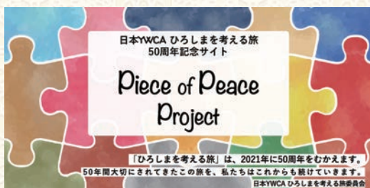
Top: 50th anniversary website Bottom: Interviews led by youths

In an effort to learn about the 50 years history of the program, the young volunteers researched and verbalized the history from various perspectives, and also interviewed people who have been involved in the "Pilgrimage to Hiroshima" in the past. The reports from the interviews will be available on the YWCA of Japan website in the future.