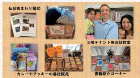
Left: YWCA Virtual Visit to Fukuoka YWCA Right: Introduction of Sendai YWCA activities