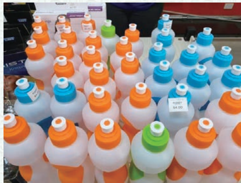
Tonga: Relief supplies