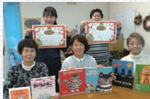
Left: Peace Messengers speaking from Hiroshima and Fukushima, during an online Talking Session: "Message for Peace from Me in Fukushima - Through the Activities of Hiroshima Nagasaki Peace Messengers" (November 27, 2021) Right: Picture book donation volunteers